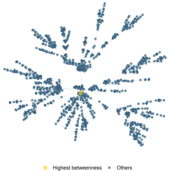
Fig. 1. Example of a preferential attachment network generated with the Barabási-Albert algorithm (30) with 1,000 nodes, one edge per node, and an exponent of 1. We focus on this network as relatively favorable to opinion leadership but in Fig. 3 and SI Appendix show other networks. The yellow node is the highest betweenness node used to test the effect of influentials.

Our control condition seeds the innovation with a randomly chosen person in the network. Our treatment condition seeds the innovation with the most central person in the network, as measured by betweenness. In most networks, betweenness is right-skewed so in our networks the most central node is anywhere from six to several hundred SDs above the mean. # We test the effects on preferential attachment networks (shown in Fig. 1) and small world networks generated in igraph (27) as well as the giant components of the Democratic National Committee email network (548 nodes and 2,442 edges), Enron email network (33,696 nodes and 180,811 edges), and a network of retweets and mentions on Twitter (532,325 nodes and 694,606 edges). We focus on preferential attachment networks in Figs. 1 and 2 but show robustness of our key finding to all these networks in Fig. 3 and SI Appendix .